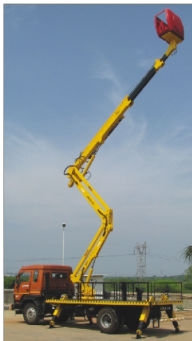
A P F - EICHER-TRUCK MOUNTED