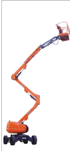
A P F - SP/ARTICULATED BOOM