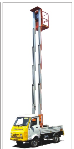
AWP-DM-D/C - ACE MOUNTED

VANJAX SALES PVT. LTD., an ISO 9001:2008 COMPANY Phone:044-4282 1000, 2625 5300 Fax: 0091-44-4598 5700