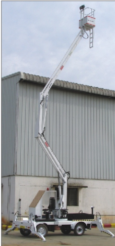
A P F - SELF PROPELLED / BO