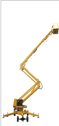
A P F - TOWABLE