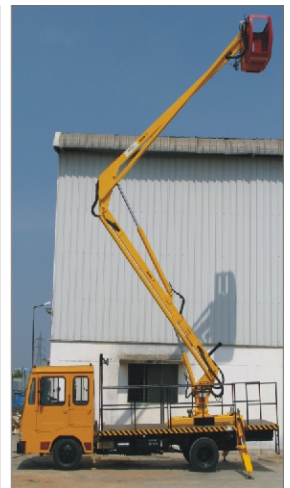
A P F - TRUCK MOUNTED / NMBC