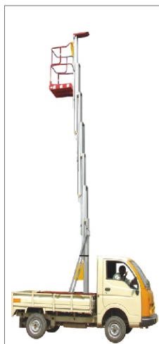
AWP-SM / VEHICLE MOUNTED