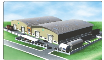
VANJAX FACTORY UNIT -2 (VXC-2)

INDUSTRIAL HYDRAULICS-TOOLS-EQUIPMENT-DEVICES-MACHINES