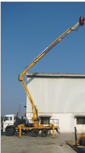
A P F - TATA 2518c - TRUCK MOUNTED