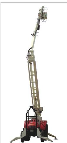
A P F - TRACTOR MOUNTED