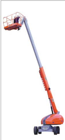
A P F - SP/TELESCOPIC BOOM