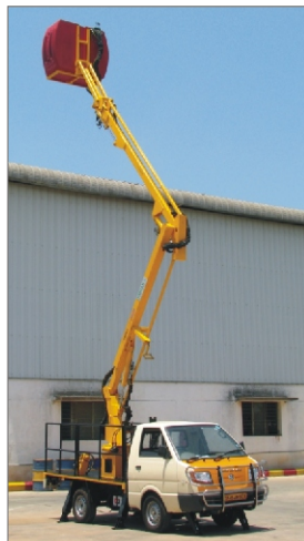
A P F - ASHOK LEYLAND/DOST-MOUNTED