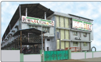
VANJAX UNIT -1 (VXC-1)