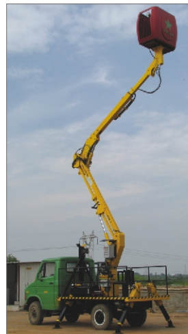
A P F - TRUCK MOUNTED/CUSTOMIZED